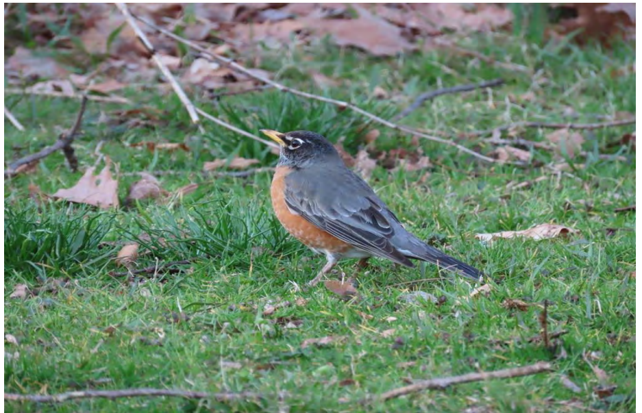
Female American Robin