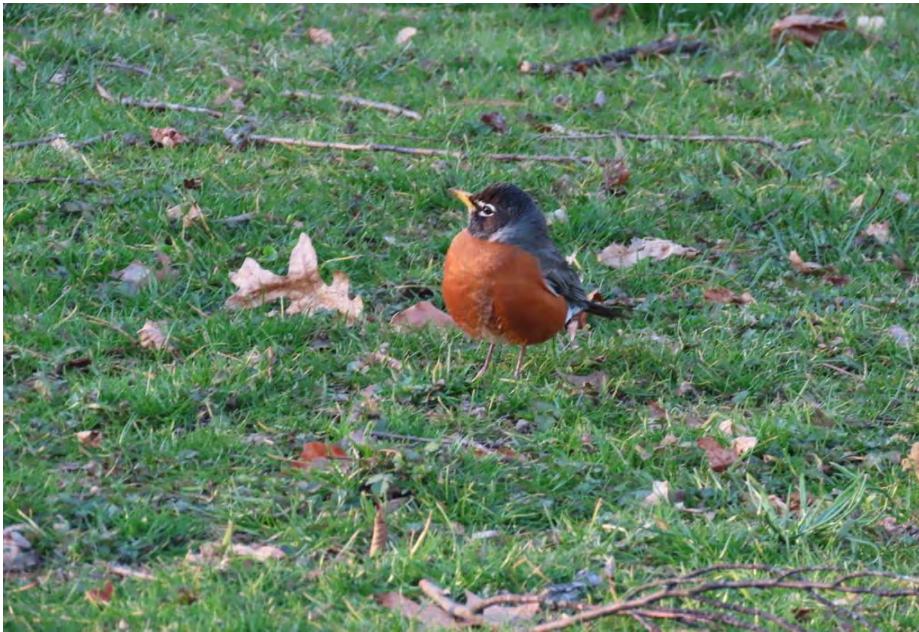
Male American Robin

Female robins look very similar but are more muted in coloring with a paler breast and a lighter hood and back than the male.