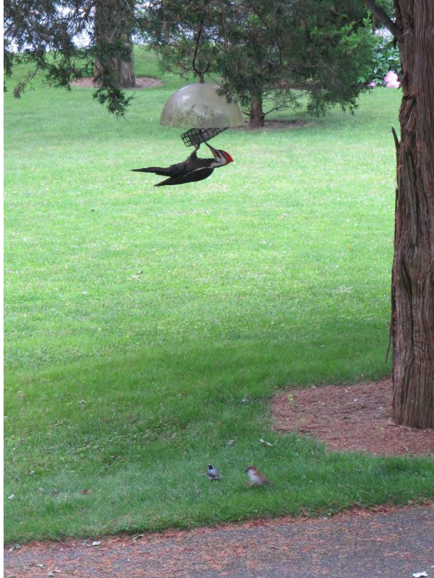
A house sparrow and a white-breasted nuthatch wait patiently.

Of course, he has an entourage waiting on the ground below for scraps.